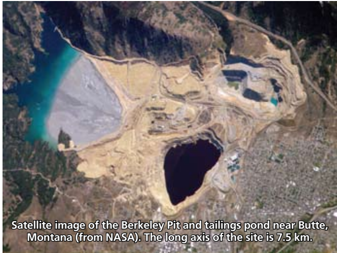
Satellite image of the Berkeley Pit and tailings pond near Butte, Montana. The long axis of the site is 7.5 km.